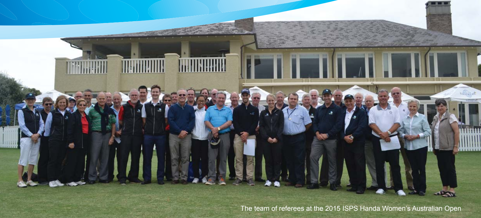
The team of referees at the 2015 ISPS Handa Women's Australian Open